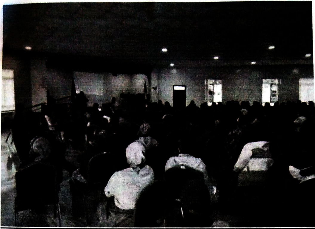
Figure 2 Public Participation held on 9th March 2020